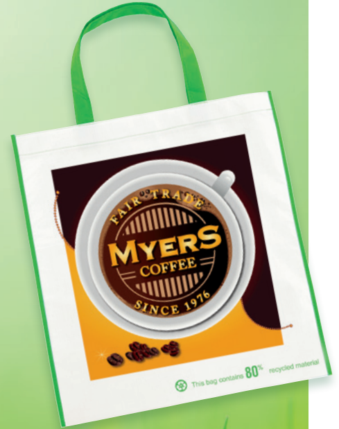
15476 Eco Non-Woven Tote Made from 80% post-consumer recycled material