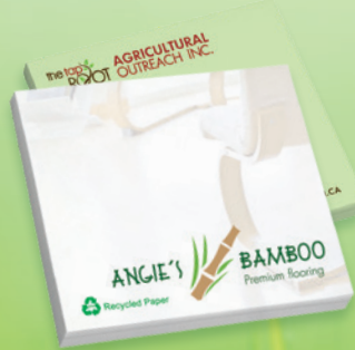
P3A3A25ECO BIC® Ecolutions® 3" x 3" Adhesive Notepad, 25 Sheet Pad Perfect for eco-conscious promotions, Ecolutions® Sticky Note® notepads contain 30% post-consumer fiber. Add the Mobius loop to your artwork for no charge.