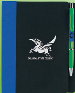
15693 5" x 7" ECO Notebook with Flags Paper sheets made from 30% recycled paper

Source: https://www.neilsen.com/us/en/insights/reports/2015/the-sustainability-imperative.html