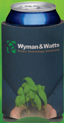
45823 Koozie® Collapsible Eco Can Cooler A minimum of 10% of the foam is made from renewable resources